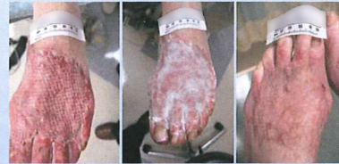
Case 1: Third degree burn debrided and treated with 0.0015 in ch split thickness skin graft meshed 1:1.5. Sutures and clips were not applied to this graft.

The technique was tested on two cases where living skin equivalent was meshed and applied directly to a debrided venous ulcer or DFU. In these cases, the powder dressing was left in place over the living skin equivalent for two weeks then the wound was cleaned and a new application of living skin equivalent was applied to the wound with another application of transforming powder dressing.