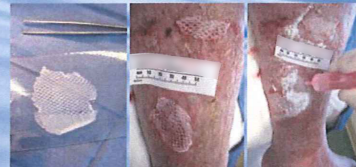
Case 3: Venous Stasis Ulcer treated with Living Skin Equivalent fixed in place using Transforming Powder Dressing.