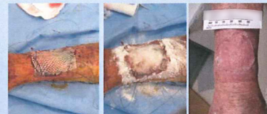
Case 2: Surgical excision site grafted with 0.015 inch autologous split thickness skin graft meshed 1:1.5. Sutures were used to anchor the edges of the graft.